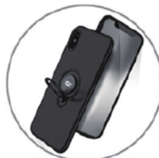
Metal Ring Case