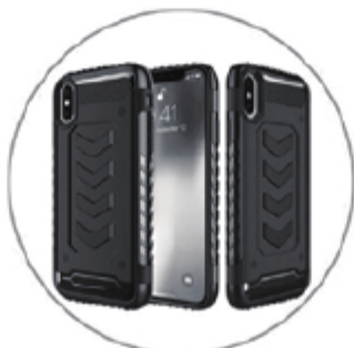
Bulky Case thickness \geq 4\text{mm}