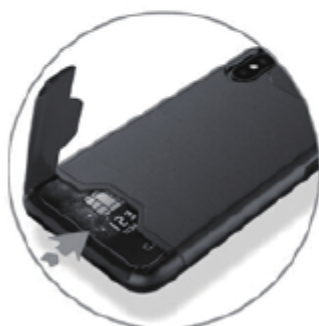
Credit Card Case