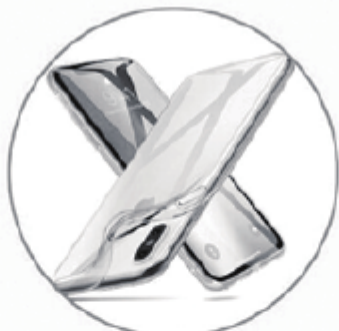
Plastic Case thickness \leq 4\text{mm}